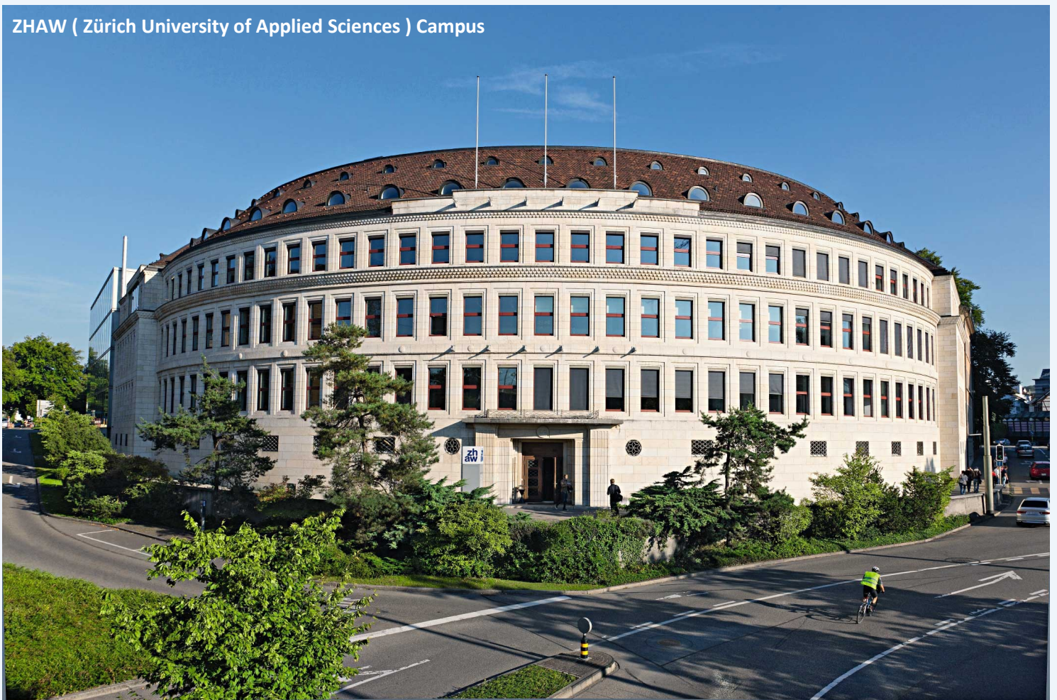
ZHAW ( Zürich University of Applied Sciences ) Campus

The call for a new round of joint research grants between the two countries in cooperation with the Swiss desk and ZHAW will be announced in the fall of this year. The call will include all kinds of support and will support young scientists, both in defining new projects between researchers in the two countries and in developing previous collaborations.