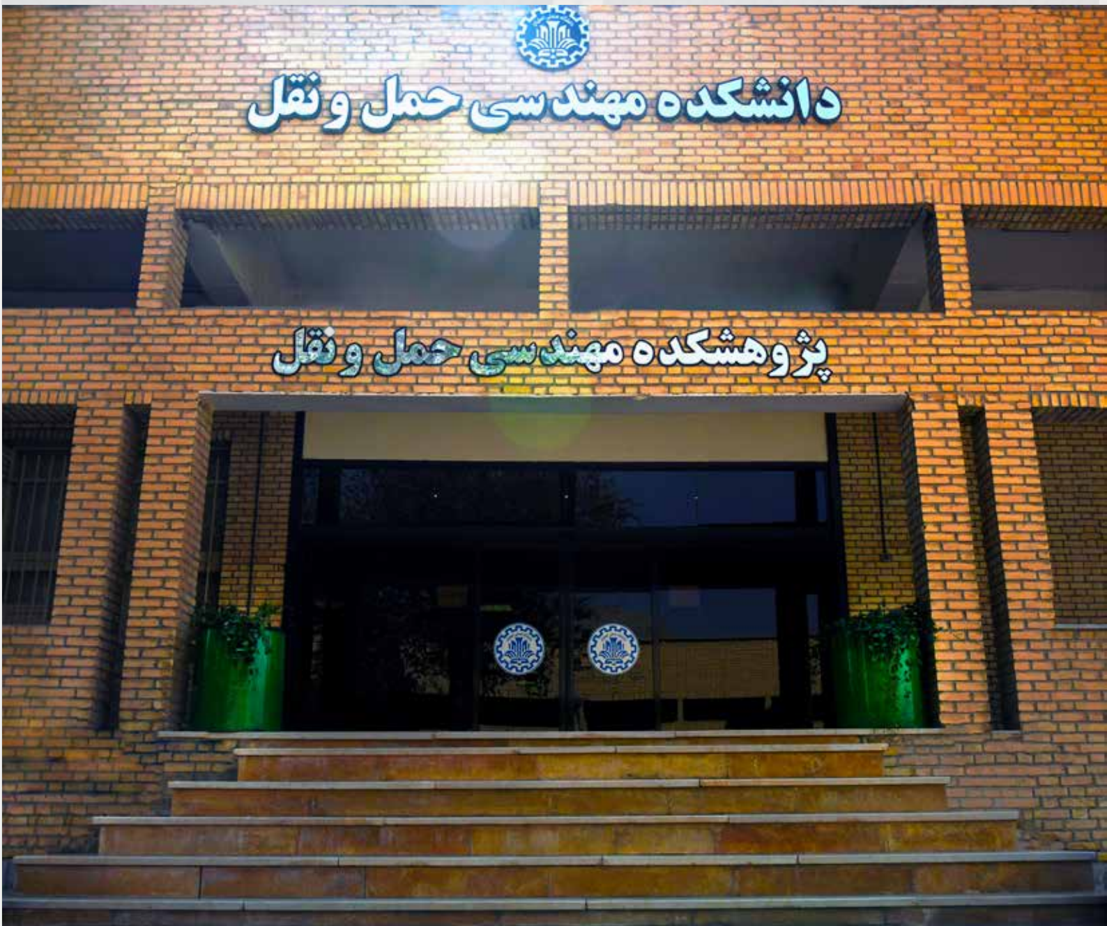
Department of Transportation Engineering