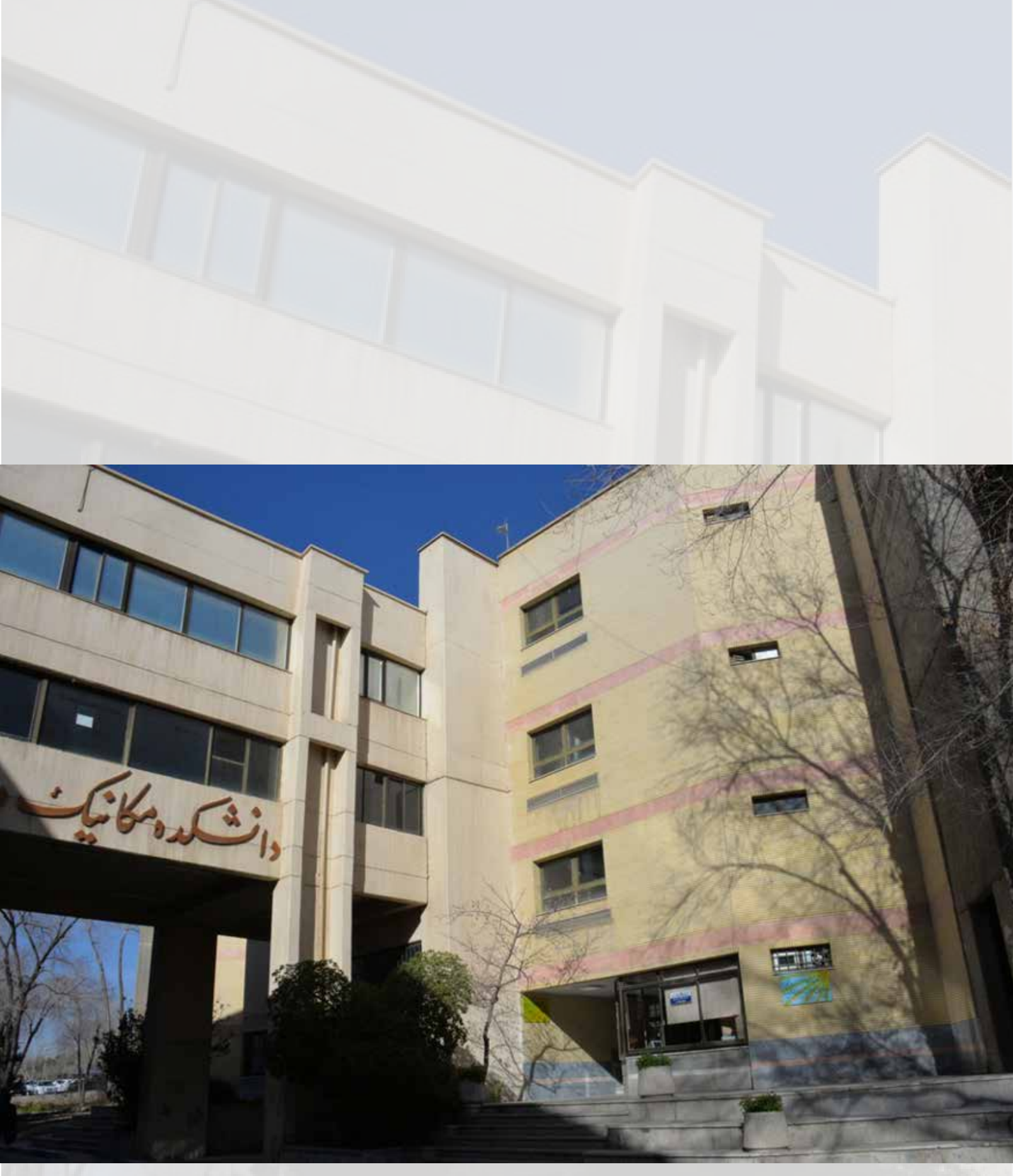
Department of Mechanical Engineering