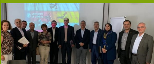
Visiting University of Geneva