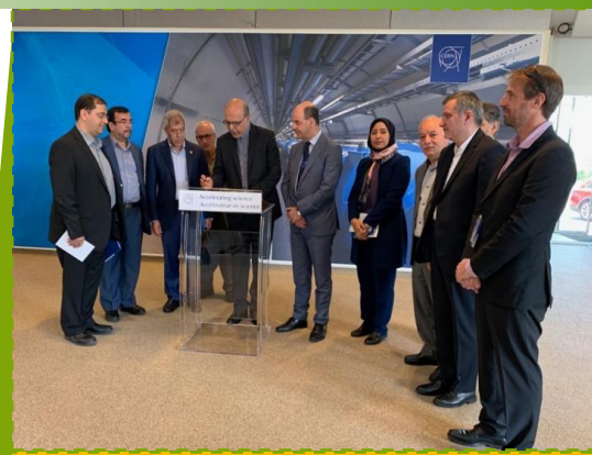
Iranian high-ranked delegation visiting CERN

https://international-relations.web.cern.ch/stakeholder-relations/states/iran