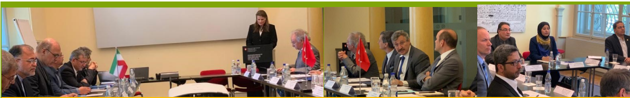
The Second Meeting of Iran-Switzerland scientific and technological working group- SERI- Bern

“internationalization is not a luxury, but a cost saving and a reduction in costs.”