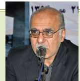
Acting Minister of MSRT:

“internationalization is not a luxury, but a cost saving and a reduction in costs.”